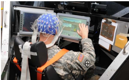
Figure 2: Vehicle Commander interacting with the simulated mission environment, wearing a 64 channel EEG cap.

For each mission, the pair drove from a Forward Operating Base (FOB) to their patrol sector in the city, Desert Metro. The Commander then navigated through a simulated city to reach three security checkpoints at specified times for mission-specific simulated rendezvous operations with local forces (e.g., deliver medical supplies to local clinic) while