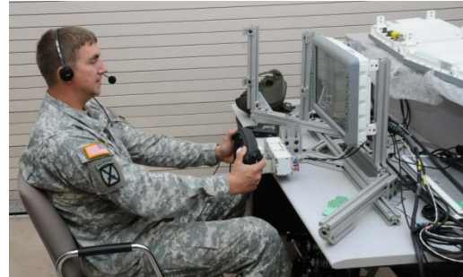
Figure 3: Vehicle Driver sitting at the static driver station, talking to the Commander over a headset and controlling the movements of the RMS with a yoked steering wheel.

aiming to maintain a presence patrol in the sector. At each checkpoint, no squad dismounts were simulated in the environment; instead, the Commander just communicated with headquarters as if the dismount activity had occurred. There was no mandatory wait time at the checkpoints, so the Commanders continued on to the next checkpoint as quickly as they desired. After completing the city mission, the pair drove back to the FOB to complete the mission.